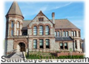
Saturdays at 10:30am

Hackley Public Library 316 W. Webster Ave Muskegon, MI 49440