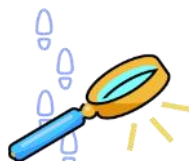
Tracking My Ancestors

Please call 231 722-8016 or email us at 1972mcqs@gmail.com for your one-on-one appointment!